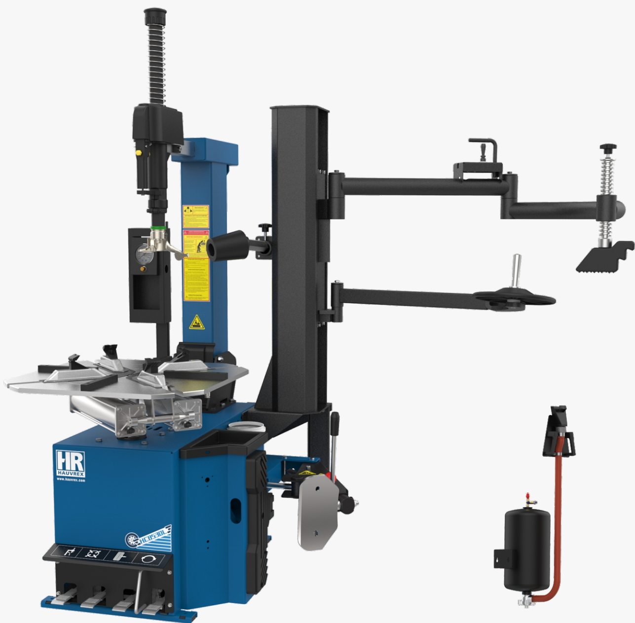
▶ IT type: Bead Seater (Tubeless Inflator)

With premium DP30 helper arm, for rims up to 28"