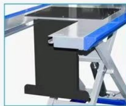
Removable Back Plate