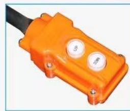
Hand-held Remote Control