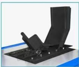
Removable front wheel chock