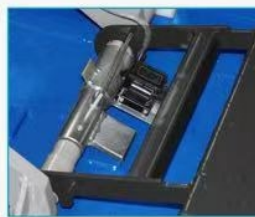
Solenoid Lock Release