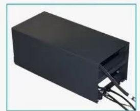
Nice-Looking Power Unit

Specifically designed for heavy motorbike and/or low ground clearance.